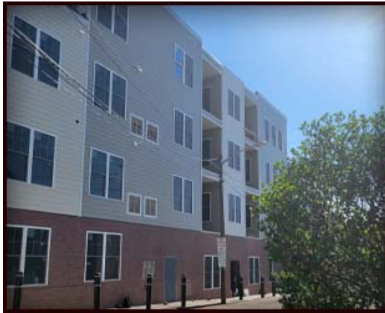
21 Station Place

https://www.piazzanj.com/property/21-station-place/