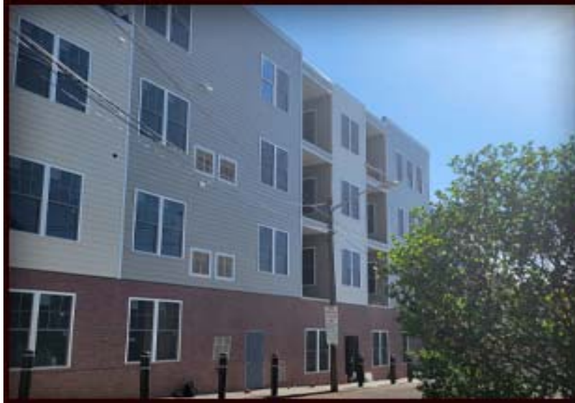
21 Station Place